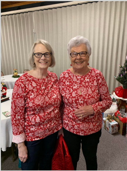
Look who we found "twinning" at the Nannie Midgett Circle Christmas Party!

We had a packed fellowship hall on Dec 4th as folks of all ages gathered for a night of bingo, prizes and fun! Can't wait to do it again soon!