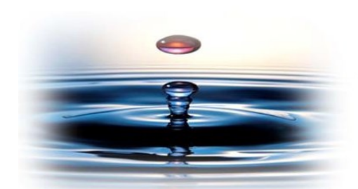
District Prayer Service

Please join us for a time of unstructured Praise and Worship As we call upon the name Of the Lord through Prayer together.